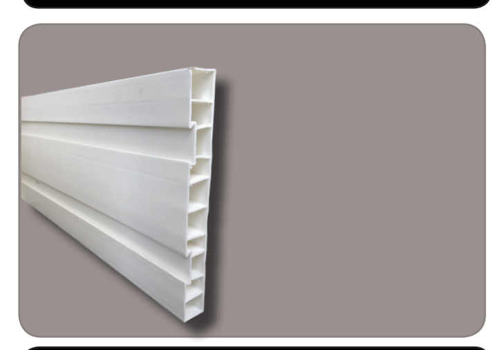
Plastiform Board Dimensions