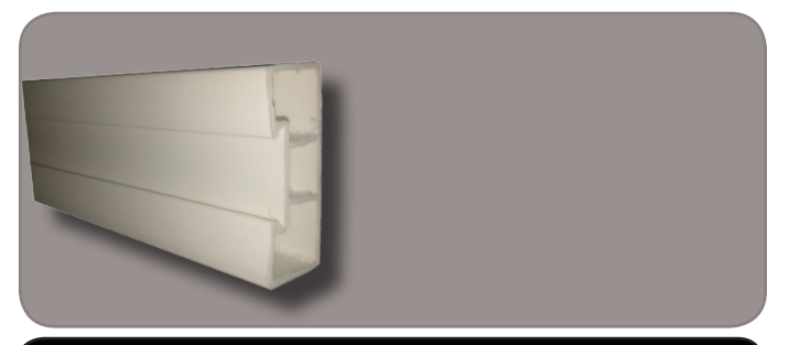
90mm Rigid Board x 5.5m 4pack