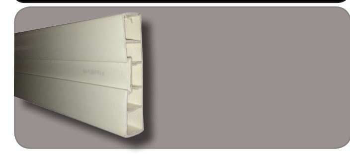
150mm Rigid Board x 5.5m 3pack