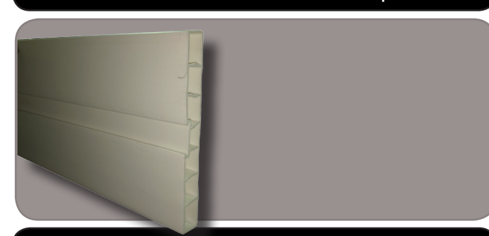
305mm Standard Board x5.5m 2pack