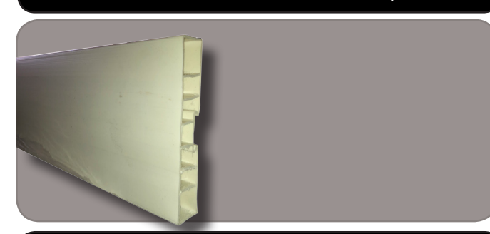
254mm Standard Board x 5.5m 2pack