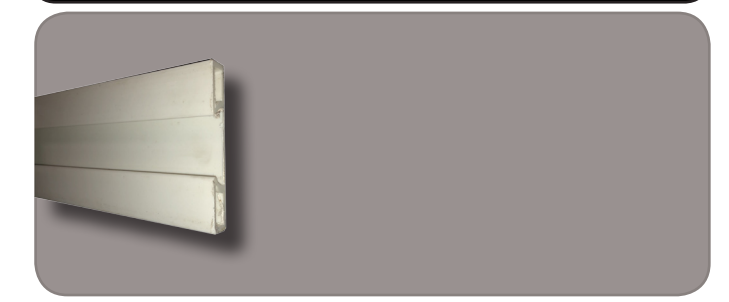
90mm Standard Board x 5.5m 5pack